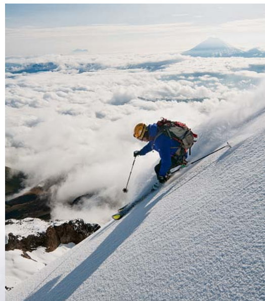
Giulia Monego gives it her all, from Ecuador's highest volcanoes to its lowest income bracket.